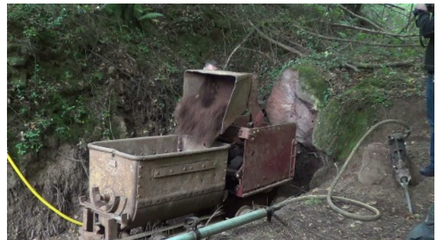
Operation of the Eimco 12B and the rock drill will continue from 11am each day.