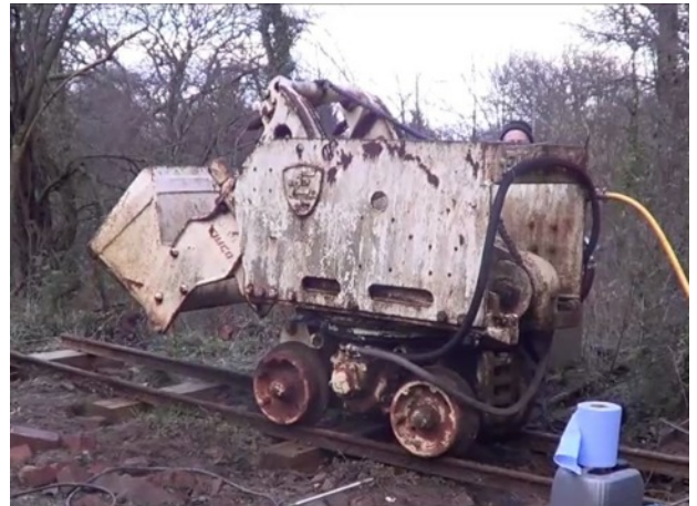
Each day it is planned to give a short demonstration of operation of the Eimco 24 at 3.30pm

Submissions are welcome that would be of interest to members of the LBLRS. These can be forwarded to me as text/disc by post or you can email or telephone. If you require anything returning please ask. Photographs, plans and drawings are acceptable as long as permission has been given by the copyright owner.