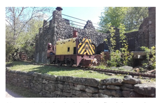
Simplex 21282 has had the horn fixed due to a loose fuse. Repaint and brake block change will be arranged for summer.

Hunslet 7446 is still stored at Clearwell. The leaking hydraulic pipe from the deadmans pedal have been removed and new fittings are waiting to be re-assembled. Questions have been raised about a faulty dynamo as bulbs keep blowing. A party from Lea Bailey visited Clearwell mid February and gave the loco a short test run.