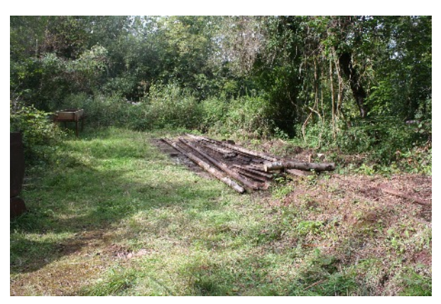
Photo shows site of the container at Lea Bailey as it was 5 years ago

16<sup>th</sup> September (subject to confirmation) 5<sup>th</sup> anniversary open day at Lea Bailey, planned to be on same day as open day at Alan Keef Ltd.