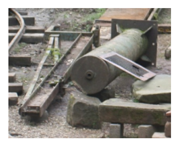
Photo below - the glass fibre tank is being moved to a new position to be used as a water tank.