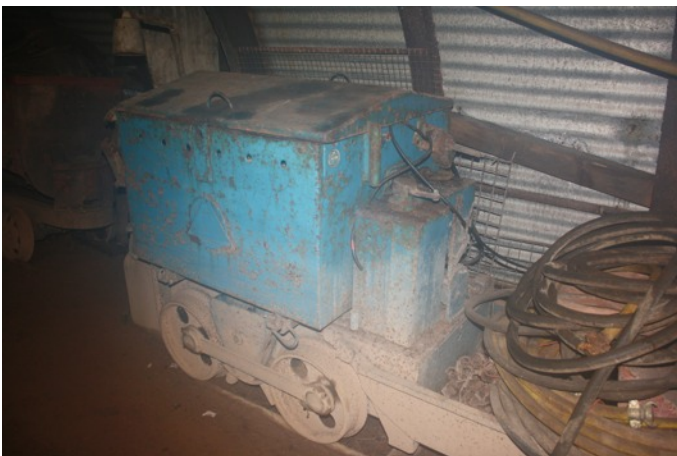
W&R loco L1009 stored out of use at Clearwell in November 2012

Works number L1009 was built in 1981. It was (is!) an 0-4-0BE of Type WR5, quoted in IRS handbook 'Industrial Railways and Locomotives of South Western England' as of 5hp, but the motor is clearly marked 4hp. Supplied new to Concord Tin Mines Ltd, Wheal Concord, Blackwater, near Truro, Cornwall, where it was given the identity 'No. 3'. Work at the site had commenced in 6/1980 to assess the viability of the project. This phase was completed in 11/1982, and production was then halted. In 6/1983 (after 15/6/1983) it moved to Carnarvon Mining Co. Ltd., Clogau Gold Mine, Bontddu, Gwynedd. In c1986 the mine operator was Clogau St. David's Gold Mines Ltd. (Wm. Roberts etc) to c1987, then from c1987 to 1990 the mine was not commercially worked. From 1/1990 it was worked under license by Mr & Mrs Bob Gunn. Final date of closure not known, and date of movement of loco is also not known. However, it apparently moved to Devon where it was to be used for a planned copper mine near South Molton, but the miner died and the loco was bought from his son and moved to Clearwell. At some point after moving to Clearwell, the battery failed and was scrapped. It then remained out of use for at least 5 years until it moved again under the power of four 12v batteries on 9 March 2014.