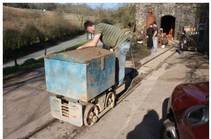
L1009 running at Clearwell on 9th March 2014 for the first time in at least 5 years.